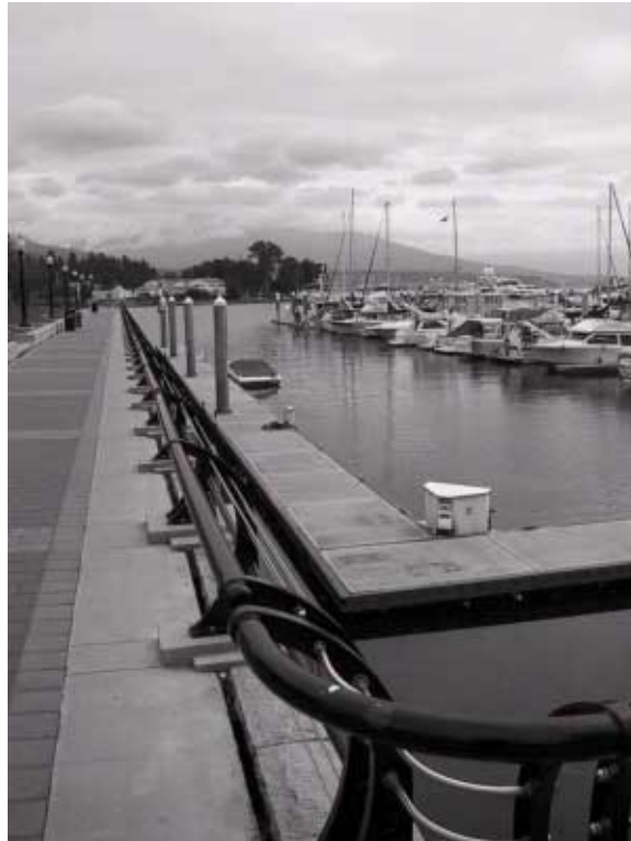
Looking northeast from the seawall at the Westin Bayshore Hotel, with Coal Harbour, Stanley Park, and the North Shore mountains are in the background.

Following initial scientific program sessions held Wednesday, the first major event is the opening ceremonies at 8:30 this morning, featuring a keynote speech by Lewis MacKenzie, retired former head of the UN Protection Force in Yugoslavia and 33-year veteran of the Canadian Armed Forces.