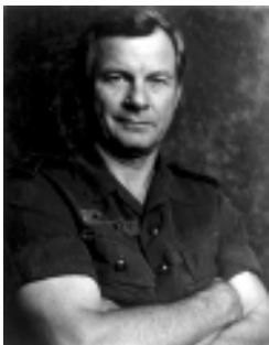
Maj.-Gen. (ret.) Lewis MacKenzie, today's keynote speaker.

The Paediatric Update has moved to Thursday this year, taking place at 2:00 this afternoon. The Journal Club follows at 4:15, leading into the Exhibitor Reception in the Grand Ballroom at 5:30.