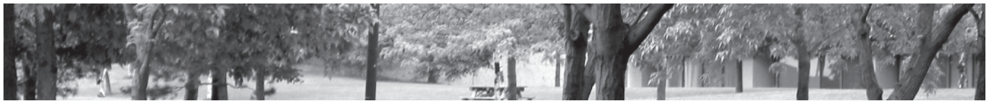
Trees in full spring growth green the park space to the west of the Westin Harbour Castle on the harbourfront shore.