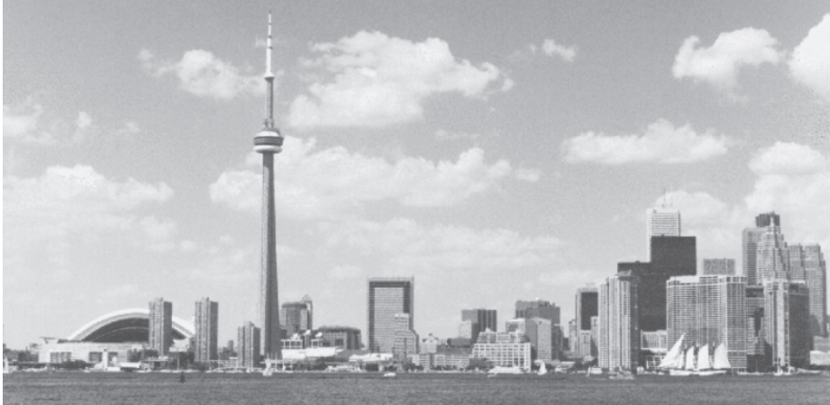
The CN Tower is the world's tallest free-standing structure. It is 555 metres high.