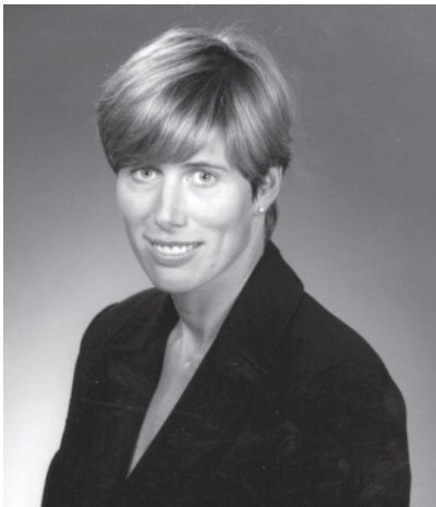
Silken Laumann is this year's keynote speaker, from 08:30-10:30 today.